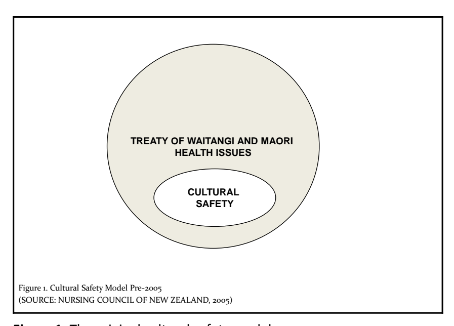
Figure 1. The original cultural safety model

written in 1991 by Irihapeti Ramsden, who developed several key objectives on which to model the concept (see Figure 1). The guidelines were then incorporated into curriculum assessment documents in 1992, and in 2005 the model was revised to take into account a broader definition of culture. However, the basic premise of cultural safety remains that of trust between the nurse and the patient.